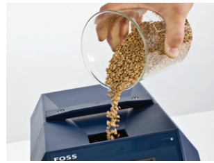
1. Pour in the sample