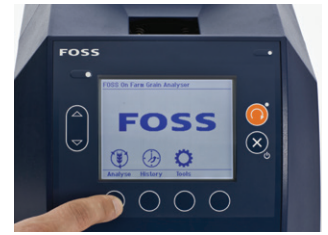
2. Select grain type