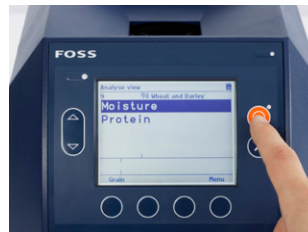
3. Press start